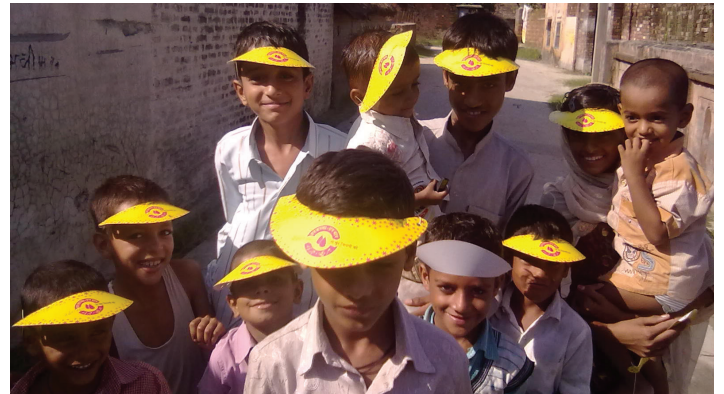
Children from the bulawa toli as they go about on booth day.