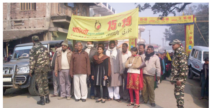
The jawans of SSB support the SMNet during the polio round.

The jawans of Sashastra Seema Bal (SSB) are protecting borders as well as the lives of children in the bordering areas of East Champaran in Bihar. Having joined hands with the SMNet, this force lends its support to the transit mobilizers by generating awareness through pre-round mass awareness rallies and setting up the highly visible polio gates at the borders. Their contribution to the programme is remarkable. Coverage in Sikta alone has gone up from 254 in March 2011 to 361 in the corresponding month this year.