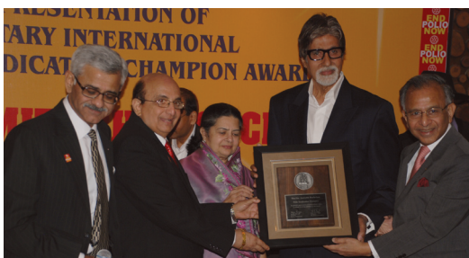
Mr Bachchan was conferred Rotary's Polio Eradication Champion award in Mumbai.

UNICEF polio ambassador, Mr Amitabh Bachchan, has been conferred the Polio Eradication Champion award by Rotary International for his invaluable support to the Polio Eradication Programme in India. Lauding the tireless work of the frontline workers, Mr Bachchan said, "We have to continue this wonderful work. I dedicate this award to our country men and assure my continued support to the efforts in making India and the world polio-free".