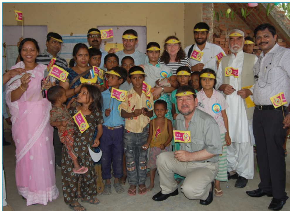
Afghanistan team with polio partners and children in Moradabad, Uttar Pradesh.