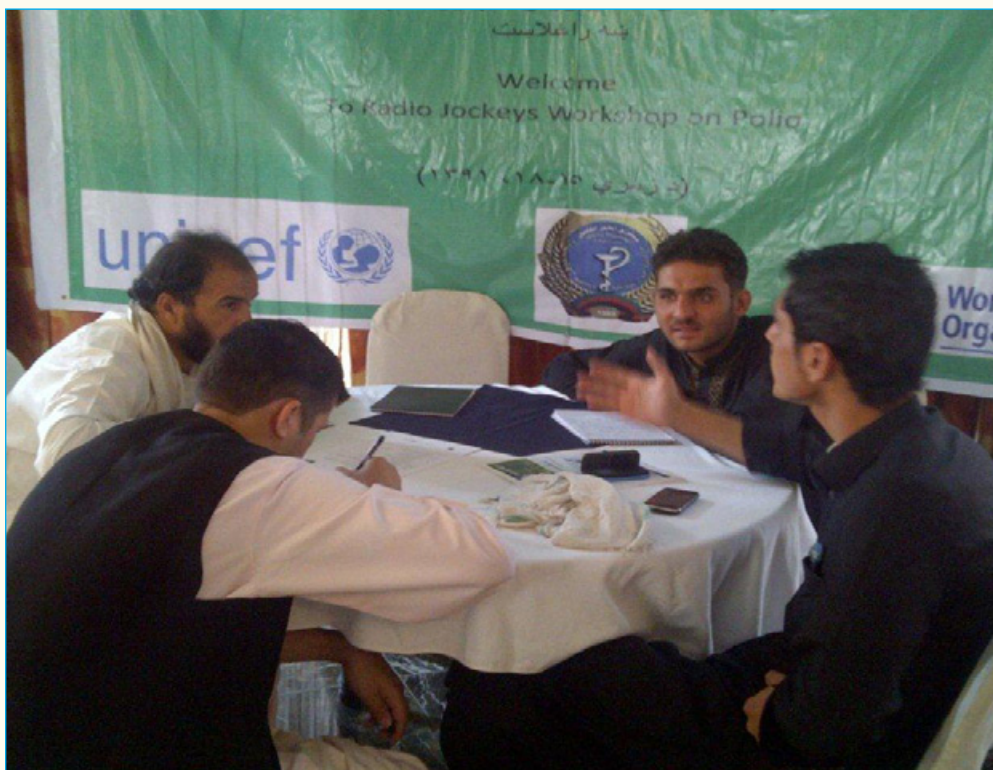
Radio jockeys at a media workshop on polio in Kabul, Afghanistan.

programmatic best practices, including: programme management, methods to maximize coverage during rounds, media advocacy strategies, monitoring and evaluation formats, communication and training materials, and ground-level tools to increase the effectiveness of front-line vaccinators and social mobilizers.