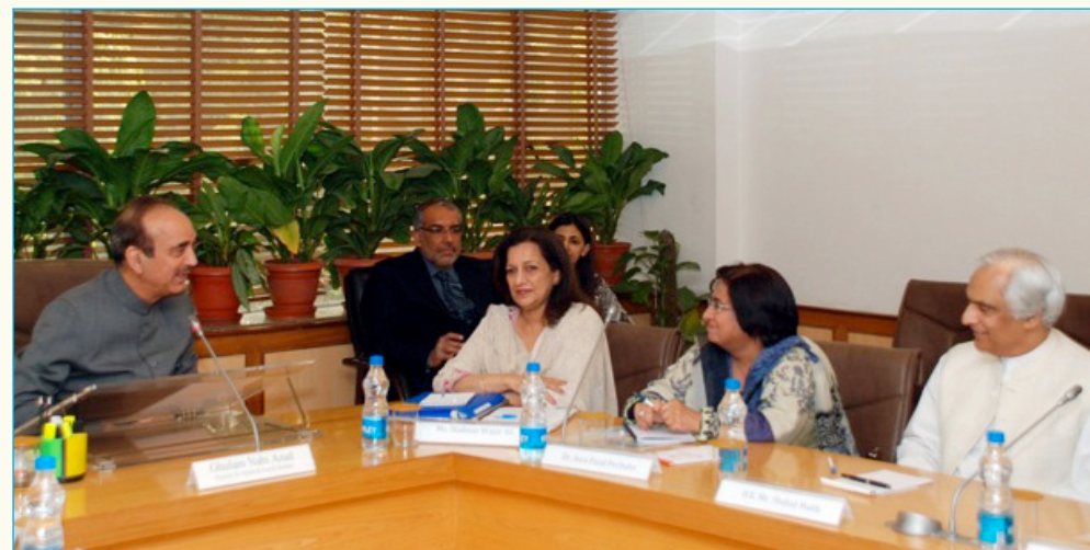
Union Minister of Health and Family Welfare, Mr Ghulam Nabi Azad with Pakistan delegation led by Ms Shahnaz Wazir Ali, Pakistan Prime Minister's Special Representative on Polio.