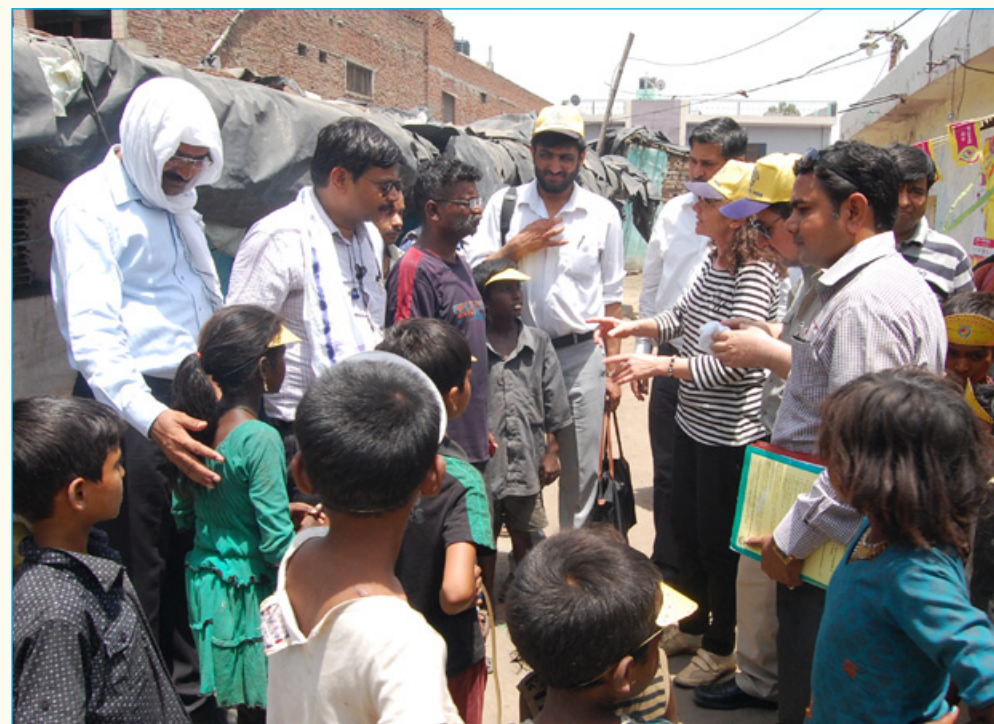
Afghanistan team interacting with the community during their field visit in Moradabad, Uttar Pradesh.

Clearly, this partnership between countries and sharing of expertise and know-how can go a long way to eradicating polio globally. ■